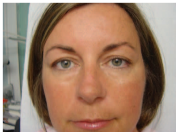
Figure 2. Improvement in lower eyelids after phosphatidylcholine injections.